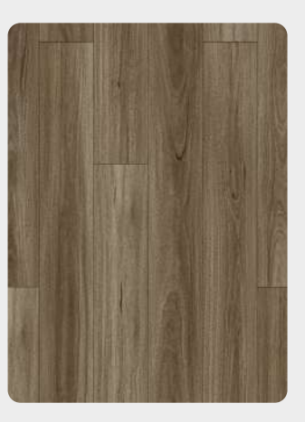
WF08 Spotted Gum