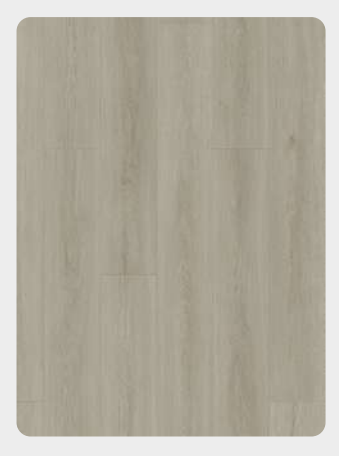
WF02 Berlin Oak