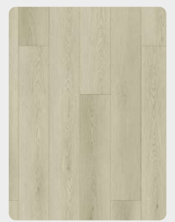
WF06 Hamburg Oak