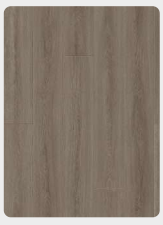
WF04 Caramel Oak