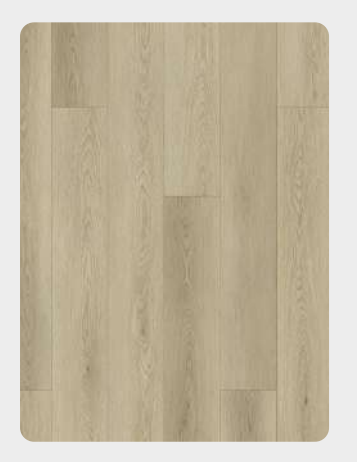
WF05 New York Oak