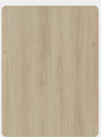
WF01 Los Angeles Oak