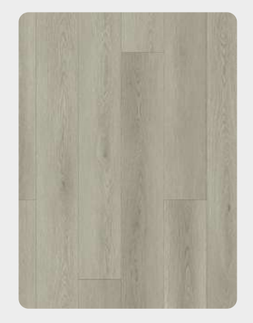
WF07 Paris Oak