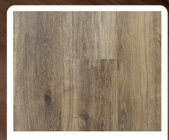
D3015 Homestead Chestnut