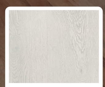
D3012 White Oak