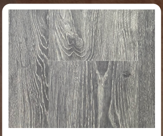
D3009 Dark Oak