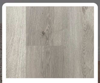
D3006 Natural Oak Grey