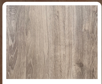
D3016 Cottage Brown