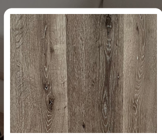
D3008 Dexter Oak