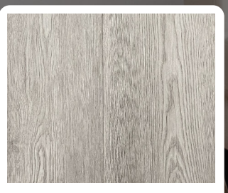
D3007 Grey Oak