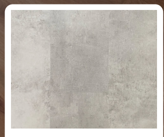
D3013 Concrete Beige