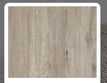
D3005 Natural Oak