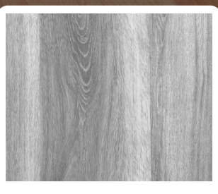
D3017 Estate Grey Oak

*Despite every effort to provide accurate images of each product's color and design, actual colors and designs may vary slightly