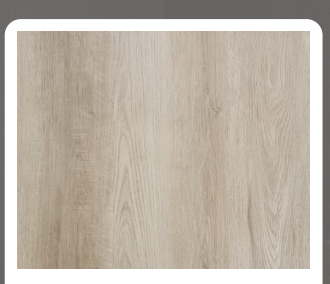
D3004 Chester Oak