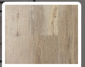
D3003 Fertile Oak