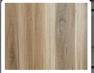
D3002 Spotted Gum