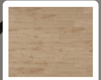
A105 Milan Oak