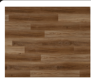
A115 Spotted Gum