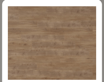
A107 Coastal Ivory