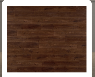
A101 Brown Vintage Oak