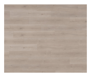
A111 Washed Oak