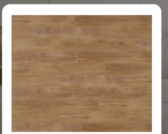
A109 Towny Oak