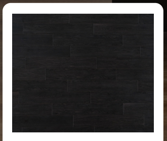
A113 Forest Black Oak