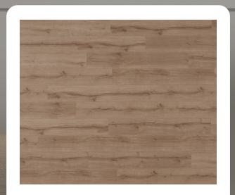
A104 Lugano Oak