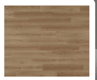
A112 Desert Natural Oak