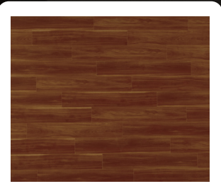
A114 Brush Box