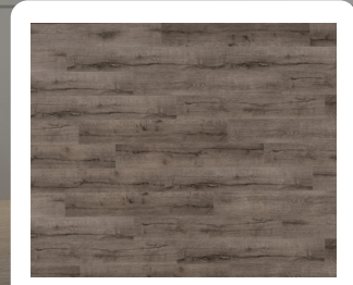
A103 Silver Grey Oak